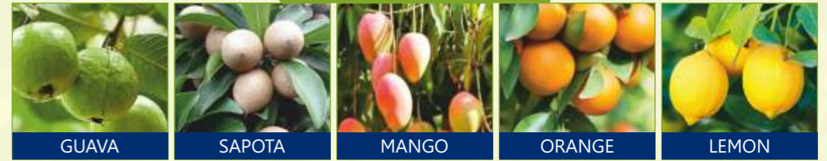
GUAVA SAPOTA MANGO ORANGE LEMON